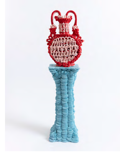
Ebony Russell - Suspiciously Beautiful: OXO Openwork , 2023. Porcelain and Stain. COLLECT 2025

Our US Programme in 2025 promises to bring an exceptional array of international