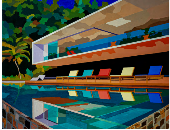
Andy Burgess - Paraty House, Brazil, 2024, Acrylic on Canvas. Expo Chicago 2025