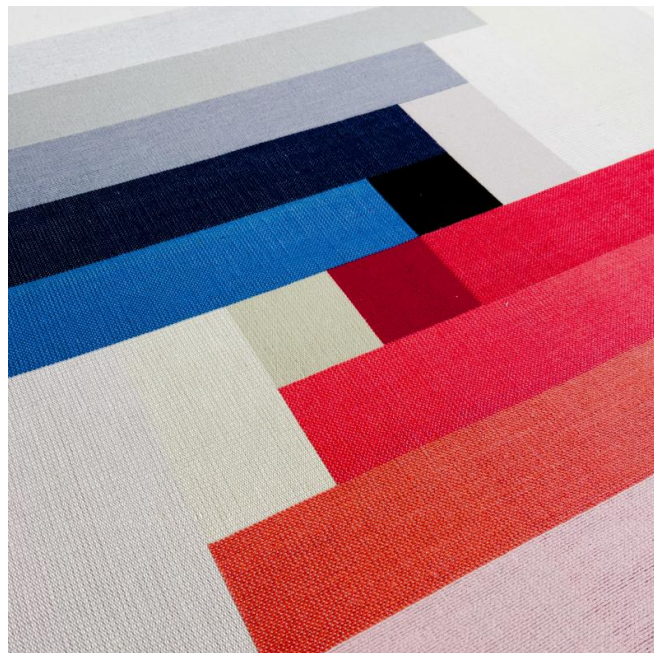
MARGO SELBY - CARRÉ SERIES, WORK 7, 2022

“However, it is also a difficult time with funding cuts threatening craft provision in universities and schools alike, so this is an important moment to encourage and support the institutions in this area”.